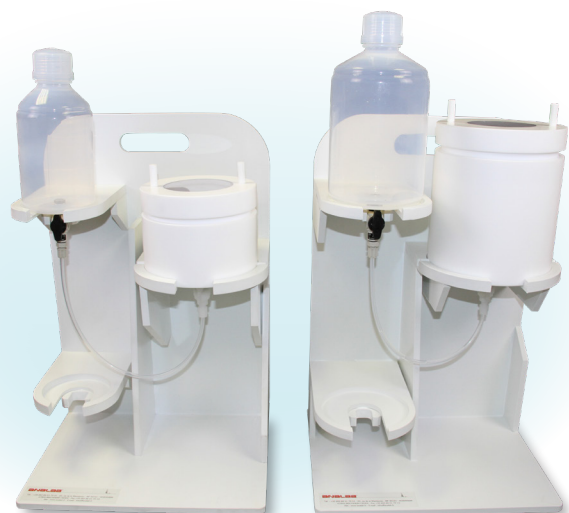
P'Tips Cleaner Medium